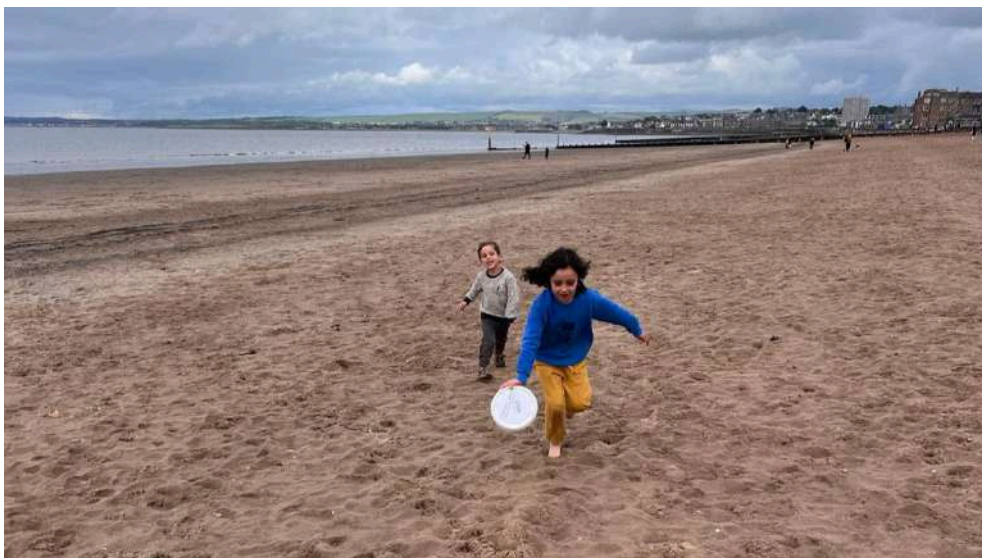
Future generations playing with GGP frisbees!